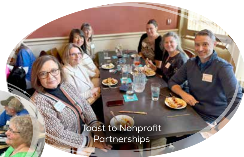
Toast to Nonprofit Partnerships