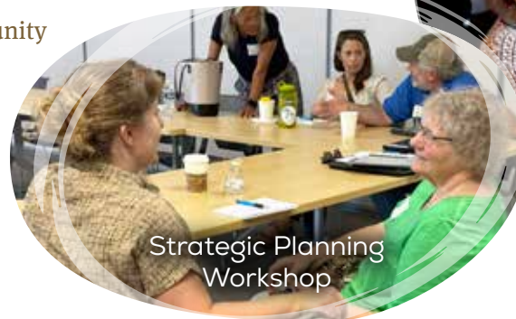
Strategic Planning Workshop