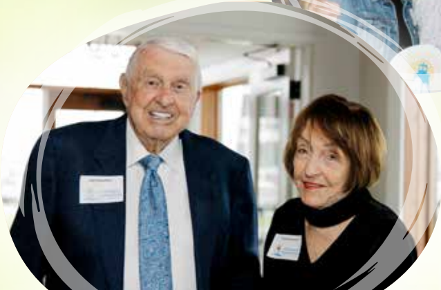
2025 Annual Gathering