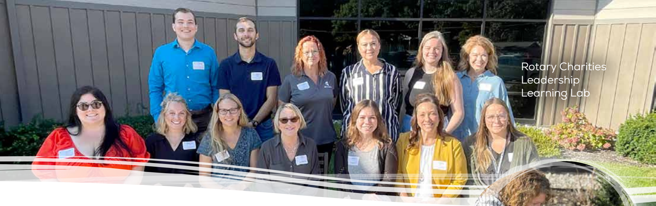
Rotary Charities Leadership Learning Lab