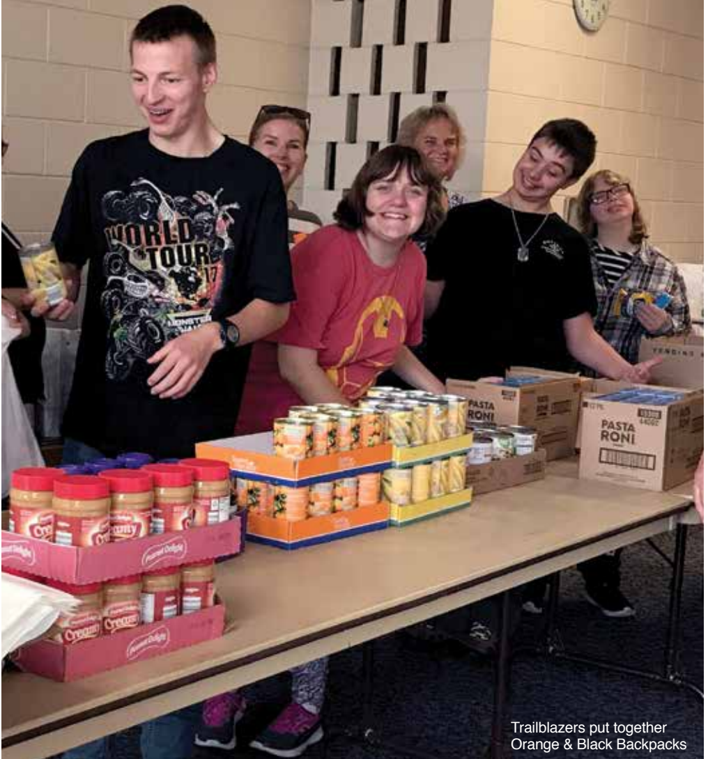
Trailblazers put together Orange & Black Backpacks